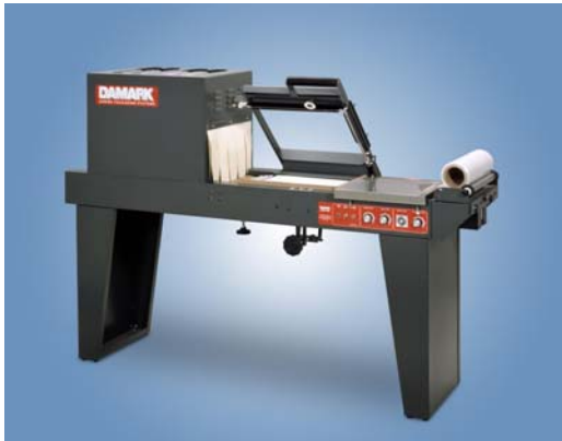
Maxi-Pak Model MP-3: