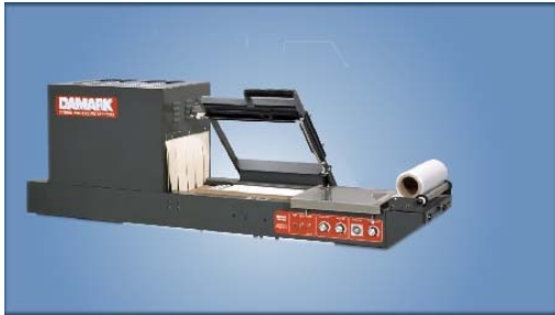
Maxi-Pak Model MP-1: